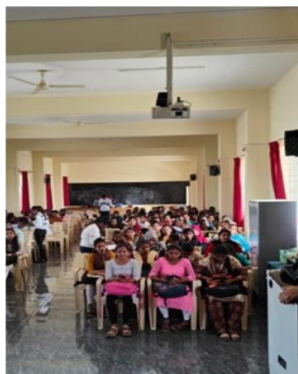
Upskilling program for 2100 youth from underserved backgrounds