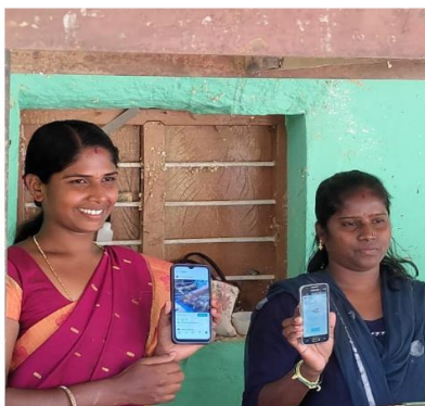
Digital upskilling of 300 rural women