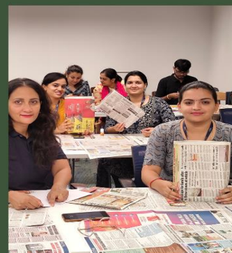
PAPER BAG MAKING