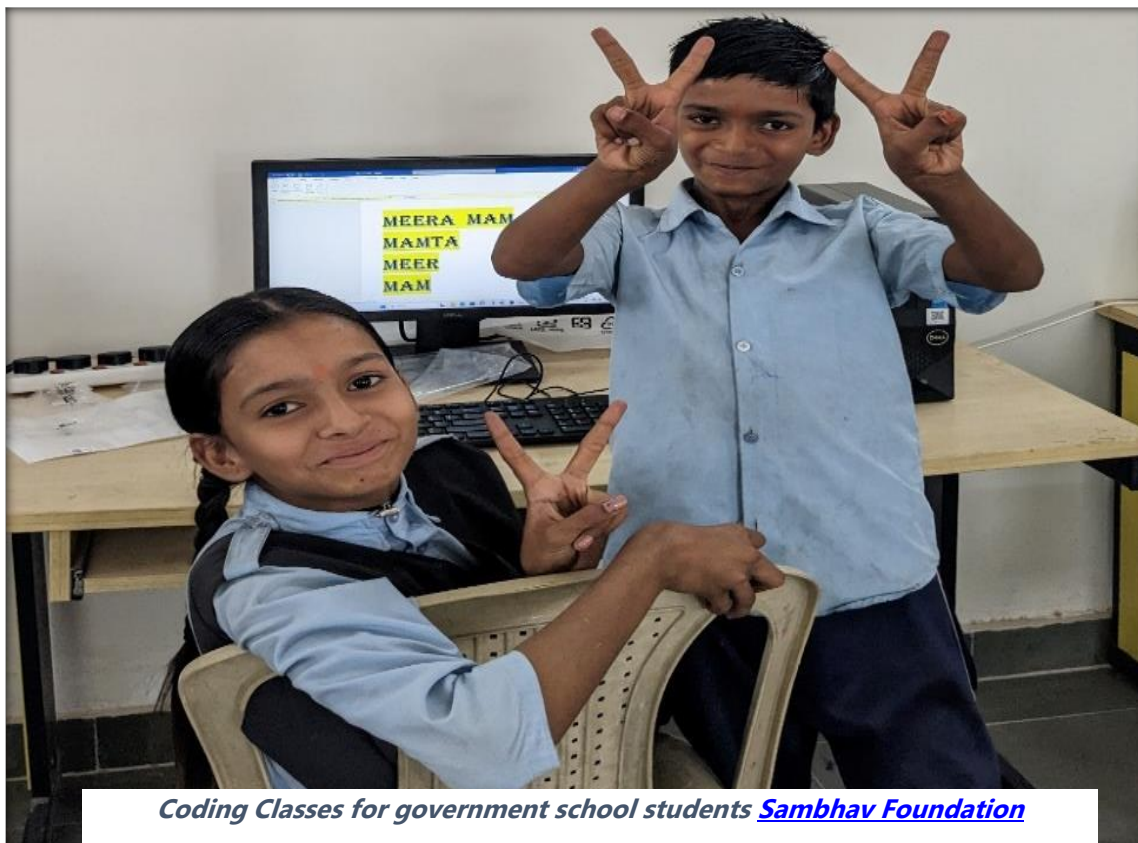
Coding Classes for government school students Sambhav Foundation