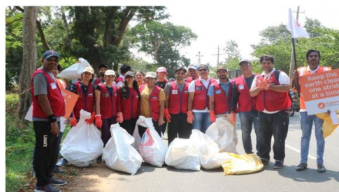
Plog Run - Nandi hills