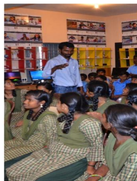
Coding classes for 1100 government school students.