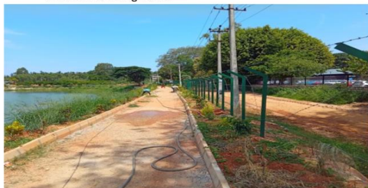
Restoration of Hunasamaranahalli Lake, an 18-acre lake in Bangalore, Karnataka