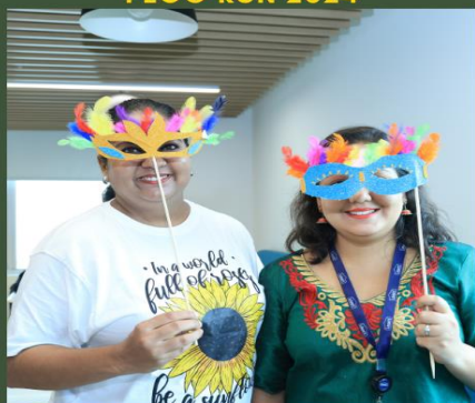
PRIDE MASK MAKING