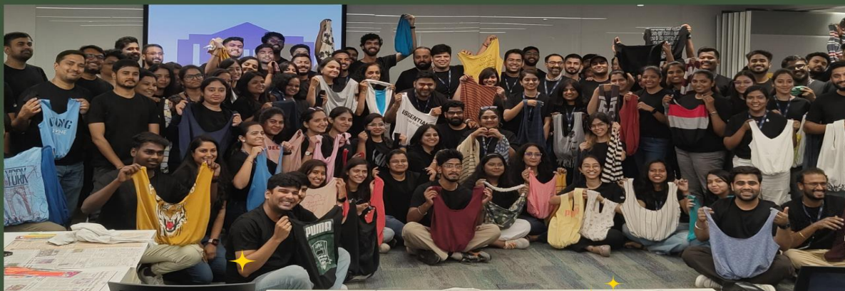
T SHIRT TO TOTE