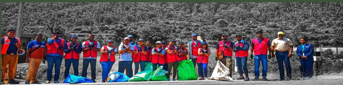
PLOG RUN 2024