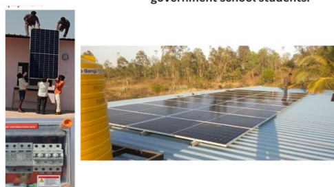
Solar unit installation in a Day care centre, Doddaballapur