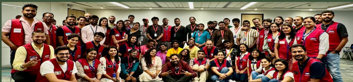
PRIDE IN BUSINESS: BUILDING ESSENTIAL SKILLSETS FOR ENTREPRENEURIAL SUCCESS