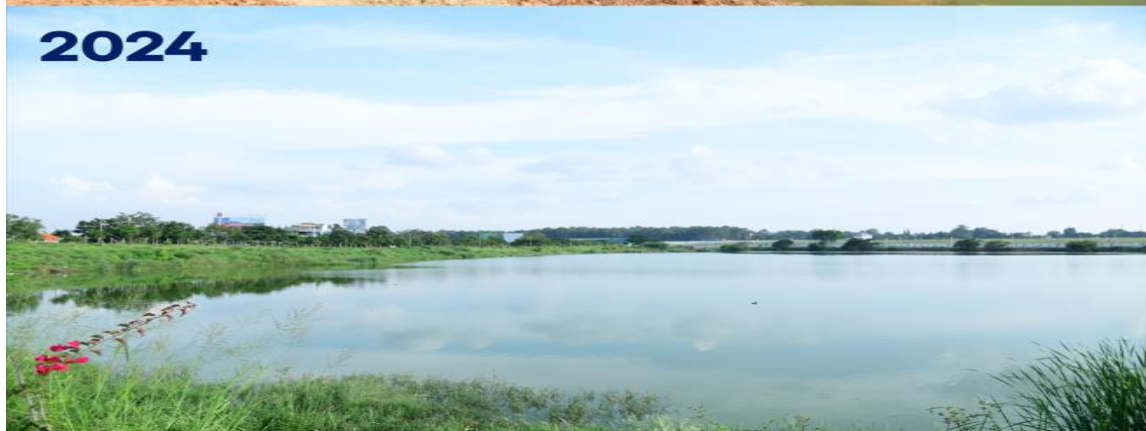
Maintenance of the Hunasamaranahalli lake - Oasis Foundation