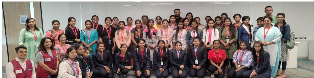
Higher education sponsorship program for 600 girls