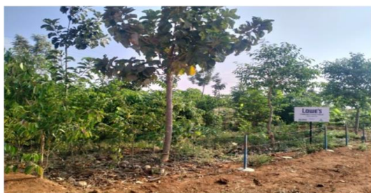
Planting of 4000 saplings as part of Lowe's Forest