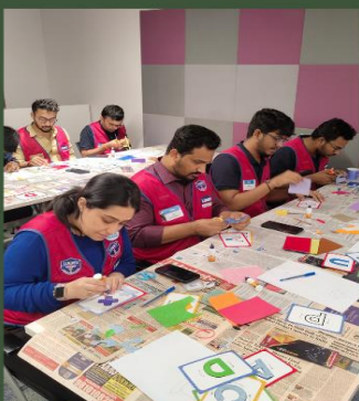
SENSORY CARD MAKING