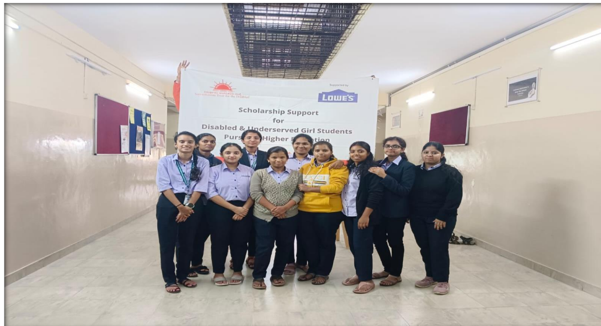
Scholarship for higher education – Beneficiaries – Sambhav foundation